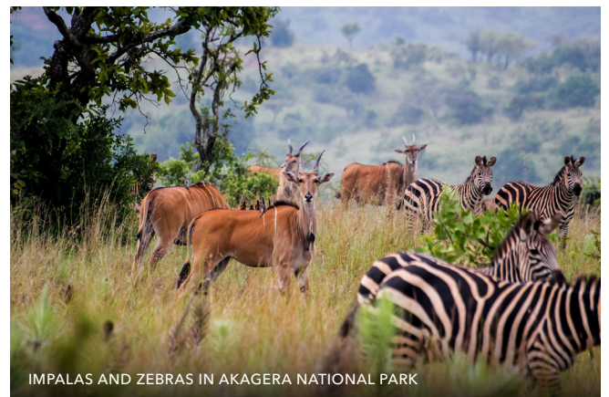
IMPALAS AND ZEBRAS IN AKAGERA NATIONAL PARK