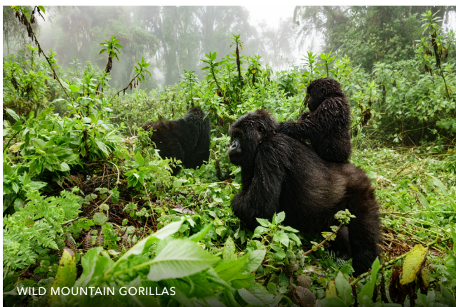
WILD MOUNTAIN GORILLAS

If you are not traveling with a U.S. passport, please check with the Rwandan Embassy for the requirements based on your nationality.