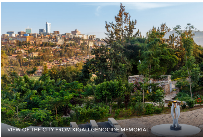
VIEW OF THE CITY FROM KIGALI GENOCIDE MEMORIAL