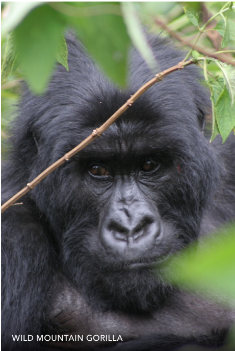
WILD MOUNTAIN GORILLA